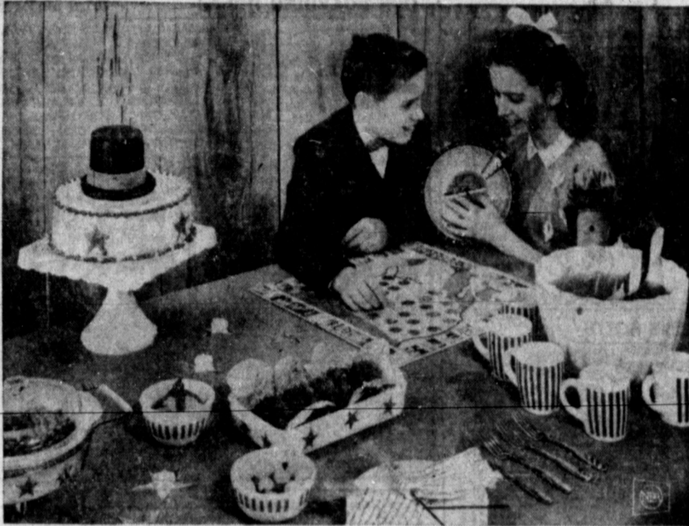
Patriotic color scheme of red, white and blue, plus a new game about American presidents, sets a spirited party theme for pre-teen gathering.