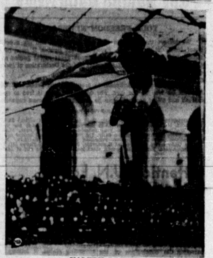
VALERY BRUMEL ... human sputnik leaves pad

BATON ROUGE (UPI) — Pressure player Arnold Palmer, the guy who uses golf clubs with the finesse of a virtuoso, was atop the golfing world today after running away from the field to register a record 72-hole total of 266 in the $20,000 Baton Rouge Open.