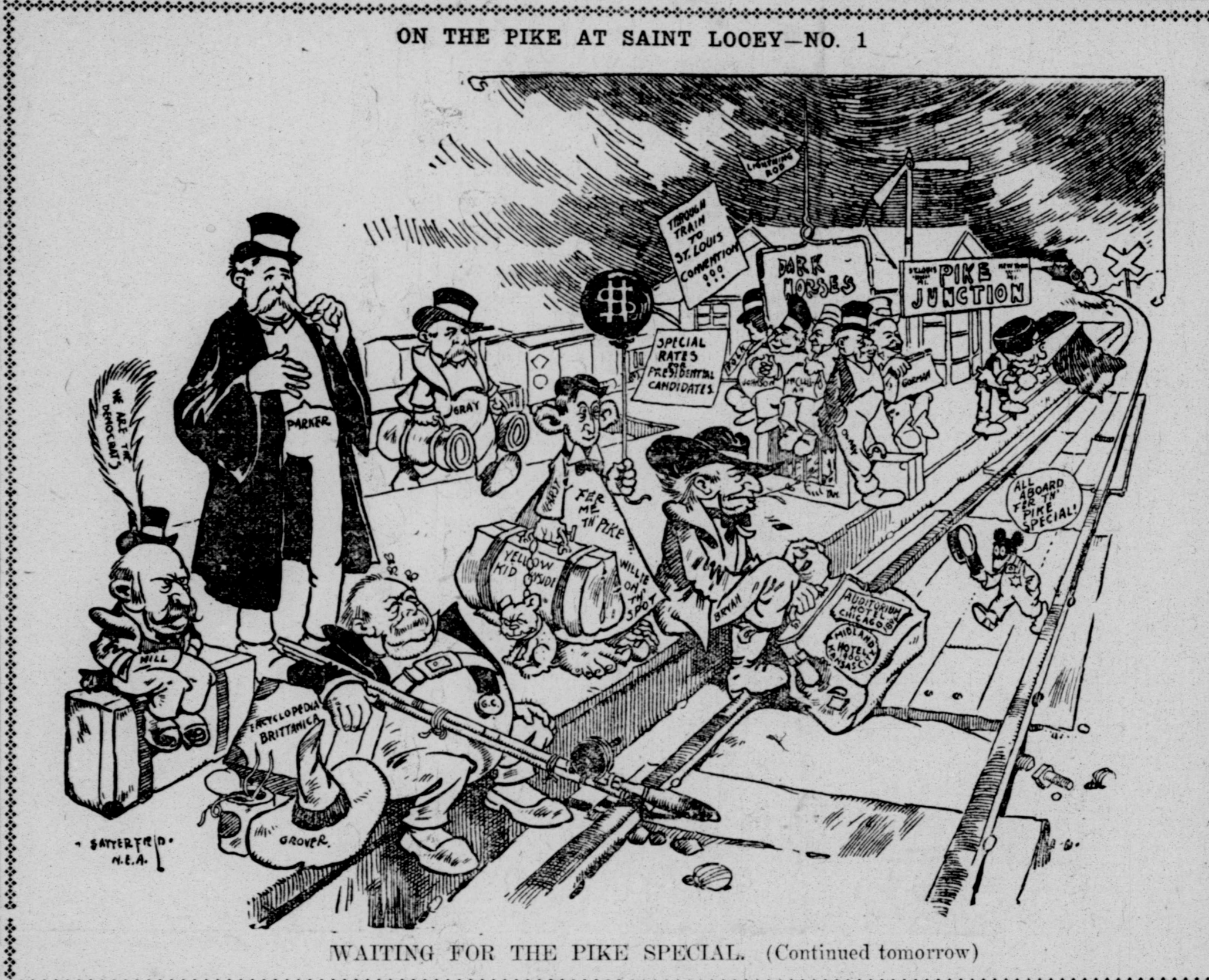
WAITING FOR THE PIKE SPECIAL. (Continued tomorrow)