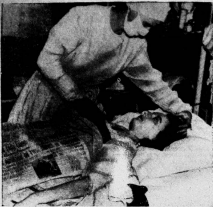
The eighteen-year-old daughter of a general overseas with the American invasion forces fights infantile paralysis in North Carolina. Her nurse is her mother, who volunteered for the duration of the epidemic emergency at the Hickory Emergency Infantile Paralysis Hospital, when the daughter was stricken.