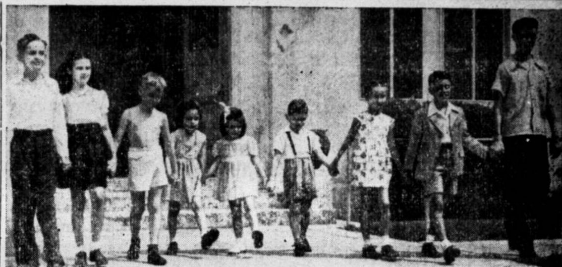
Nine swell reasons to give to the March of Dimes. These youngsters walking out of Miami's Jackson Memorial Hospital, won their battle over infantile paralysis last year, thanks to dollars and dimes given to the Fund-Raising Appeals of The National Foundation for Infantile Paralysis. The March of Dimes this year occurs January 14-31.