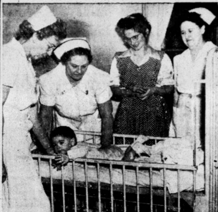
EVEN TO THE YOUNGEST —Arms and back stricken with infantile paralysis, this eight-months-old baby received modern care and treatment at the Crippled Children's Guild, Buffalo, N.Y., through the assistance of the Stuben County Chapter of The National Foundation for Infantile Paralysis. America's contributions to the March of Dimes, January 14-31, make this work possible.

Substantially the guide system set up by WMC, which is in accordance with the Directive to Selective Service by the Director of War Mobilization and Reconversion, James F. Byrnes, reflects the intensified demands on American resources of men and materials to wage the war, and the fact that the past years of war have absorbed the more readily available resources.