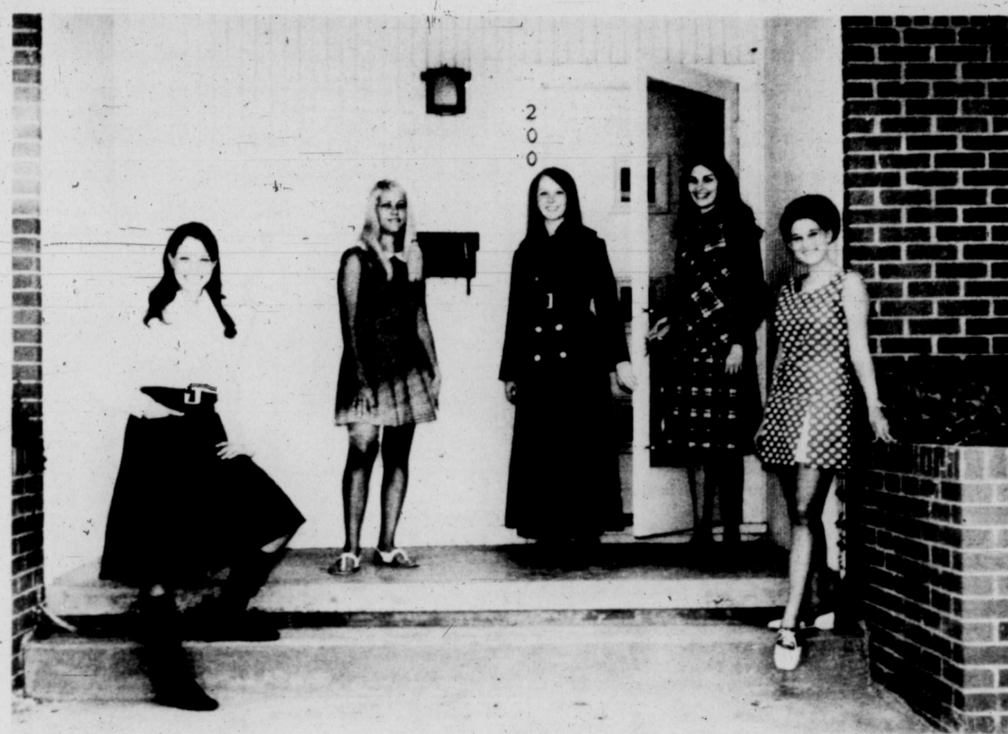
The Long and Short of It

A portion of that bond account amounting to $27,500, becoming due Aug. 15, plus $2,500 accumulated in interest was figure re-invested by Sadler.