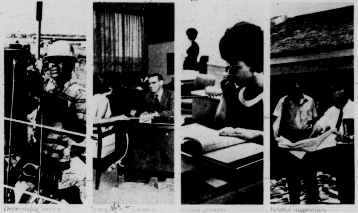
Dependable service... Justice to customers... finding answers... helpful suggestions