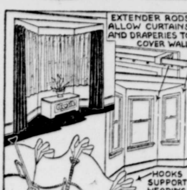
EXTENDER RODS ALLOW CURTAINS AND DRAPERIES TO COVER WALL