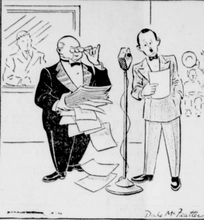
"And now, folks, a brief message from our sponsor!"