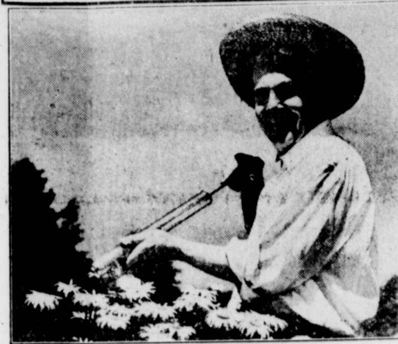
A reflector was used to brighten the shadow portions of this fine informal portrait.

SNAPPING informal portraits is one of the most interesting and satisfying phases of photography. It is within range of the humblest camera. And for outdoor picture taking of this type, spring and summer are ideal seasons.