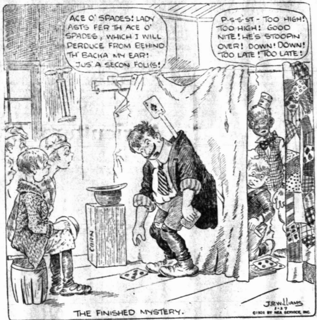
THE FINISHED MYSTERY.