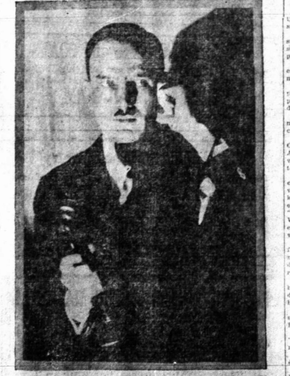
Get here quick," said the voice in Jimmy's car. "Your father has just been found dead in a room."