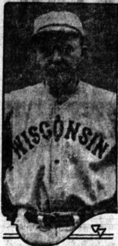
Presenting the famous Ray Schaik, White Sox catcher, in a new role—that of baseball coach at the University of Wisconsin. Schaik will tutor the Badger candidates for the 1926 campaign. He comes with an enviable record and should bring out the best there is in the college diamond tossers.

competition. The Matadors have now turned their attention to the contest here Saturday night against the Canyon Normal Buffaloes.