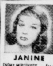
JANINE ENEMY MERCENARY... for a vice she gambled everything.

TYRONE POWER PATRICIA NEAL STEPHEN MCNALLY