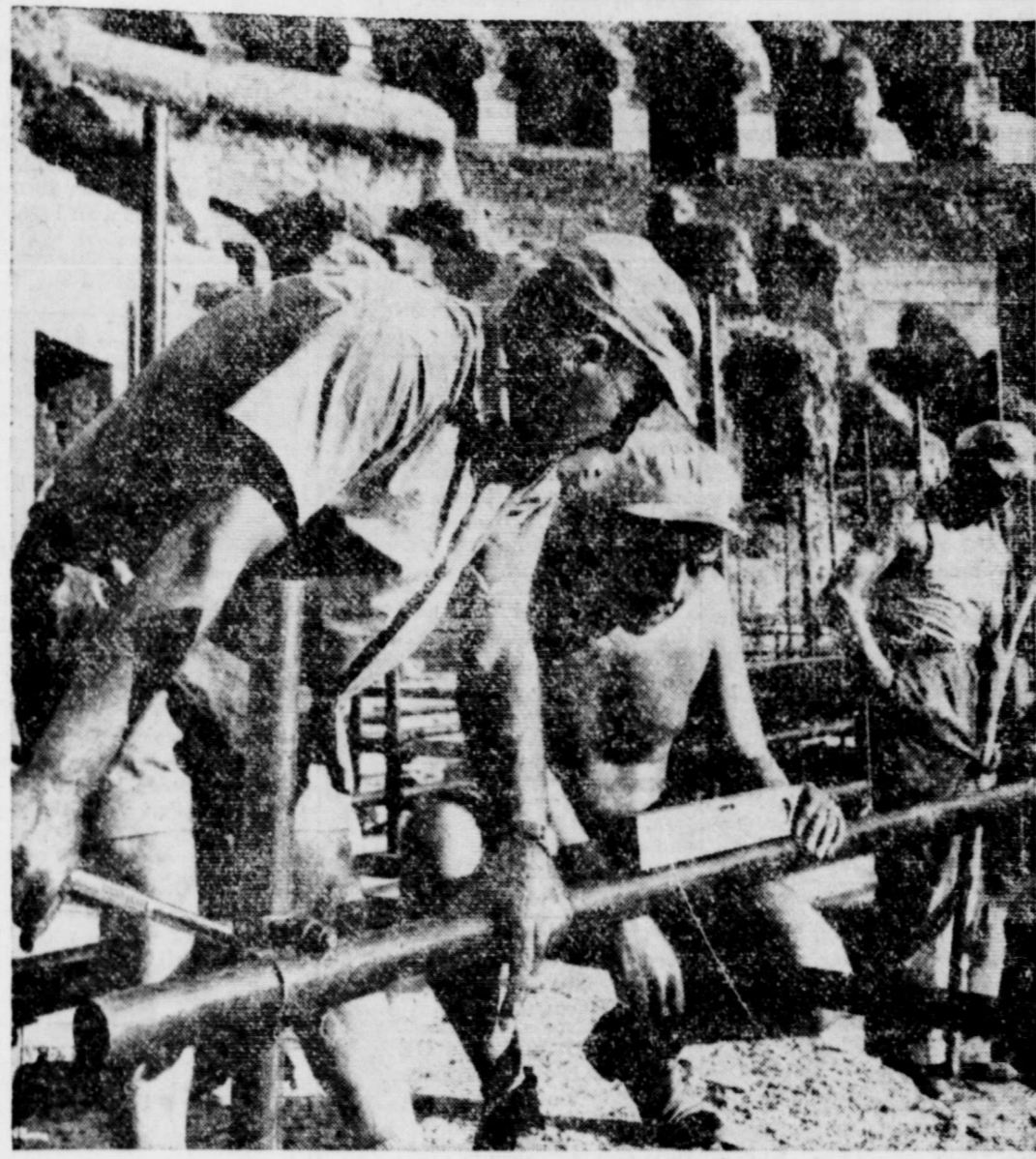
NOW THEY'LL KNOW—In the historic Colosseum in Rome, workmen are busy constructing a sturdy iron-tubing foundation for a huge stage. When it's completed, some time in 1953, gladiators and wild animals will recreate scenes of the ancient arena's former sporting glory. Thousands of residents and tourists will witness spectacles like those of 2000 years ago.