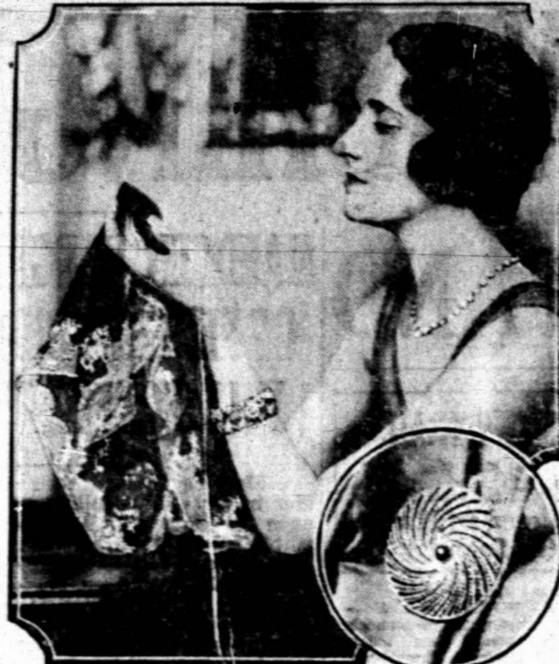
The harmony of spring accessories: Milady here wears a Chanel necklace of triangular crystals and a bracelet of amethysts, rhinestones and black enamel set liberally in silver. Of black chiffon, gold lace and tiny flowers in pastel shades is the large evening handkerchief of black chiffon she is admiring. Inset, a swirling marcasite kerchief pin of rhinestone with a jade center.

BY HENRI BENDEL For NEA Service NEW YORK, March 28.—Spring is the season when little things hold the stage—all through the realm of nature.