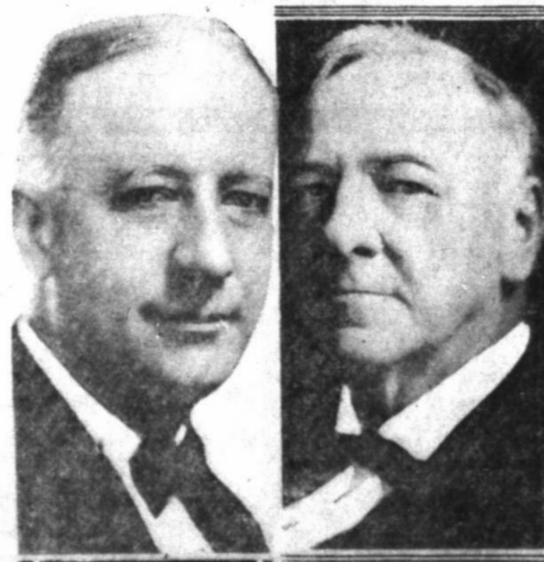
Tammany chieftains hope to induce Josephus Daniels above, North Carolina editor, who was secretary of navy in the Wilson administration, to consider himself a vice-presidential candidate with Al Smith in 1928.