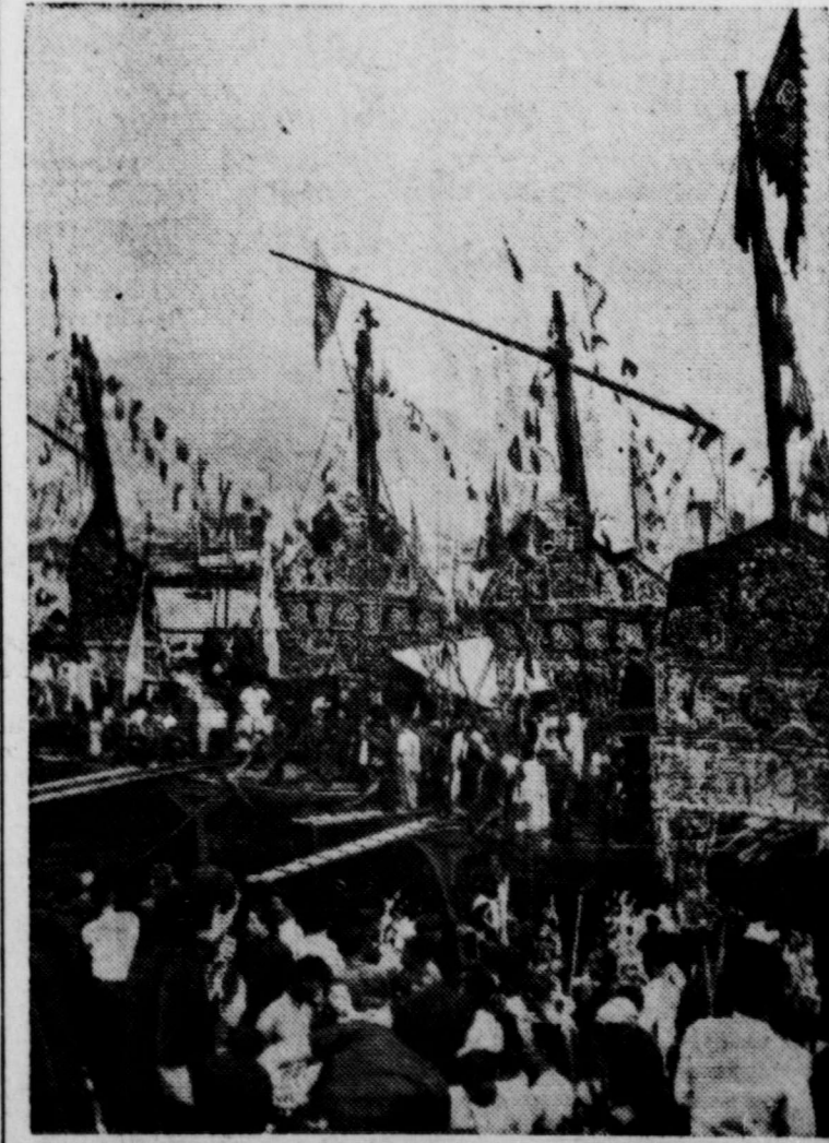
WISH FOR FISH—Probably the most popular deity around the island of Hong Kong is Tam Kung who, the fishermen believe, has absolute control of their catch. Lest a fisherman find himself without fish at the end of a hard day, he must win the Lord Kung's favor. Hence the gaily-covered boats and the fireworks—a ceremony designed to persuade the fish to bite.