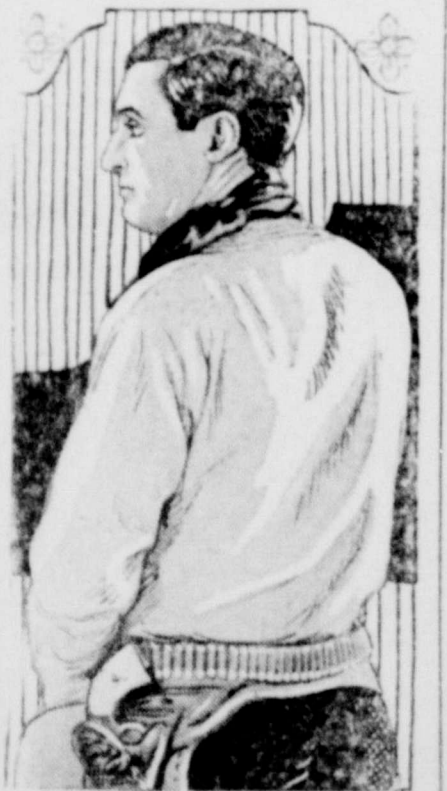
TOM MIX - WILLIAM FOX STAR

The gold output of Canada in 1922 amounted to more than 1,200,000 ounces, an increase of 31 per cent over 1921.