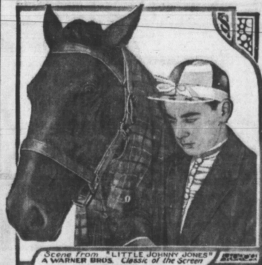
Scene from "LITTLE JOHNNY JONES" A WARNER BROS. Classic of the Screen