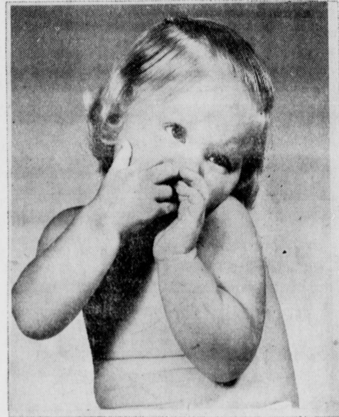
"May I have it all in dimes, please?"

Of course you can. Whatever suits your convenience. That's why we call ourselves the "full service" bank for we serve your convenience with checking and savings accounts, with safe-deposit boxes. And we serve with loans of every kind . . . auto loans, farm loans on crops or livestock, and business loans. Not to mention services like estate planning and administration. Come in and get acquainted with ALL our convenient services . . . there's a lot of them too.