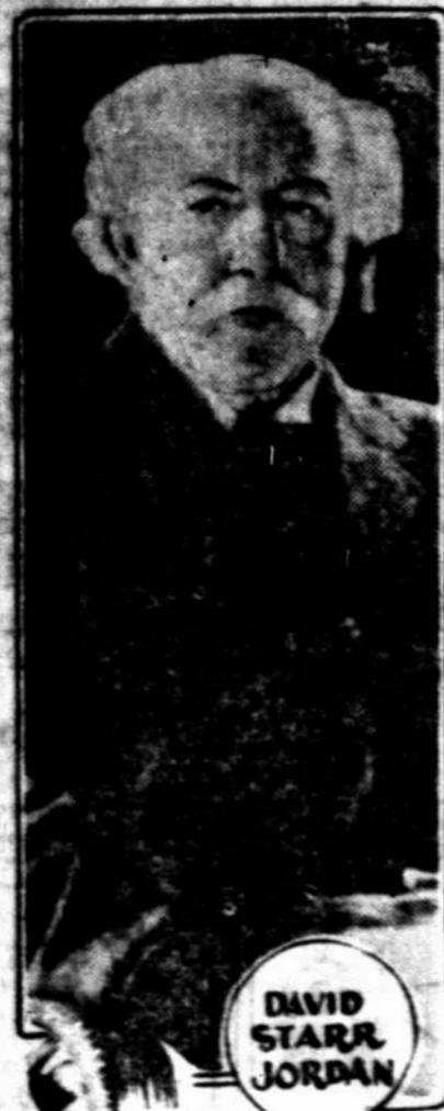
DAVID STARR JORDAN

Every collective wrong dies in its moment of triumph. The mills of the gods grind slowly when their grist is of any consequence.