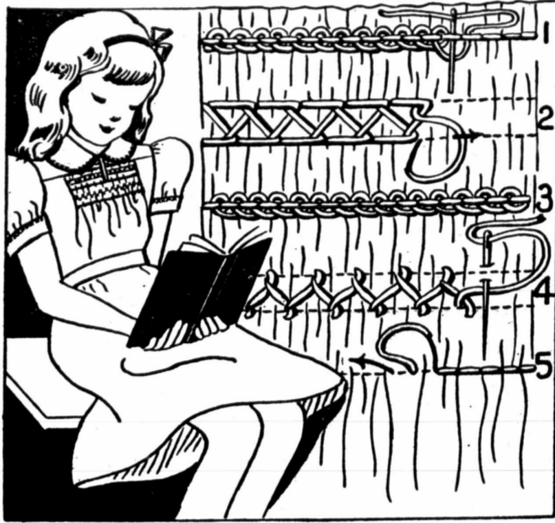
Save time with mock smoking.

IF SMOCKING seems to be time consuming, here is a short cut that saves hours. The first step is to shirr the material by machine. Loosen the tension slightly and stitch in straight rows; then pull up the bobbin thread to gather the material.