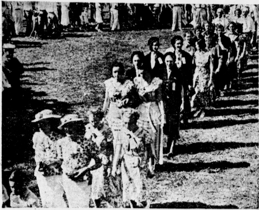
Parades, dances, boat rides and baquets (featured) the annual international twins convention which (opened) Friday (August 26) at the Morrison hotel in Chicago. The organization, head-

HIGHWAY BEING TOPPED THROUGH LORAIN Highway No. 80 through Loraine is receiving a new topping