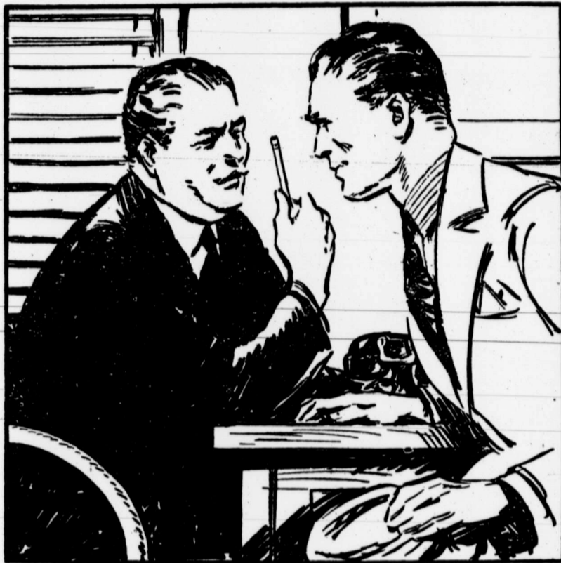
"Besides," Kneeland interrupted, "you can make yourself useful."