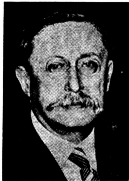
SOCIALIST LEON BLUM "The hour is too grave..."

If he expected radical France to take this pronouncement quietly, M. Daladier was badly mistaken. Two cabinet members quickly resigned. Next day, Socialist Leader Leon Blum, whose cabinet was over-