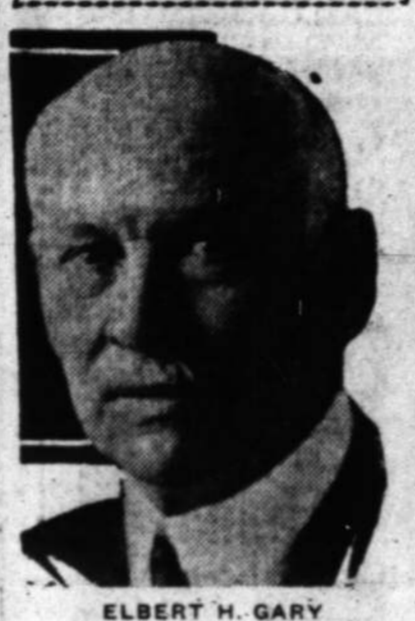
ELBERT H. GARY