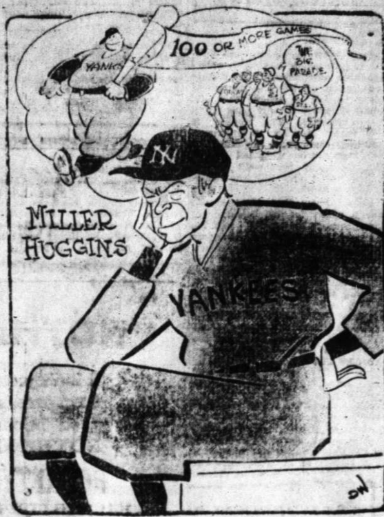
BY BILLY EVANS