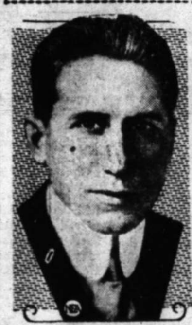
JAMES OLIVER CURWOOD

A victim of a Streptococcus infection, James Oliver Curwood, noted American author, died Saturday in his home in Okawaso, Michigan. His stories of the North country made him one of the most popular of modern writers.