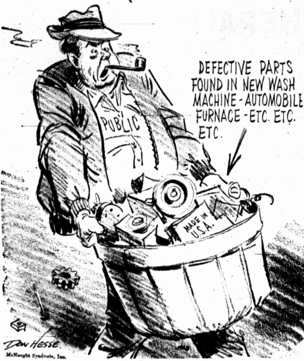
'I ALWAYS SAID I PITY THOSE POOR ASTRONAUTS'

As to your fear of being changed emotionally, I would say that with the uncertainty you harbor, you need to have your emotions changed. Never fear that any change which God works will be damaging. The change that He will bring will be for the better, for "He doeth all things well." Put the weight of your faith in Christ. He has never disappointed anyone who came in full commitment and dedication.