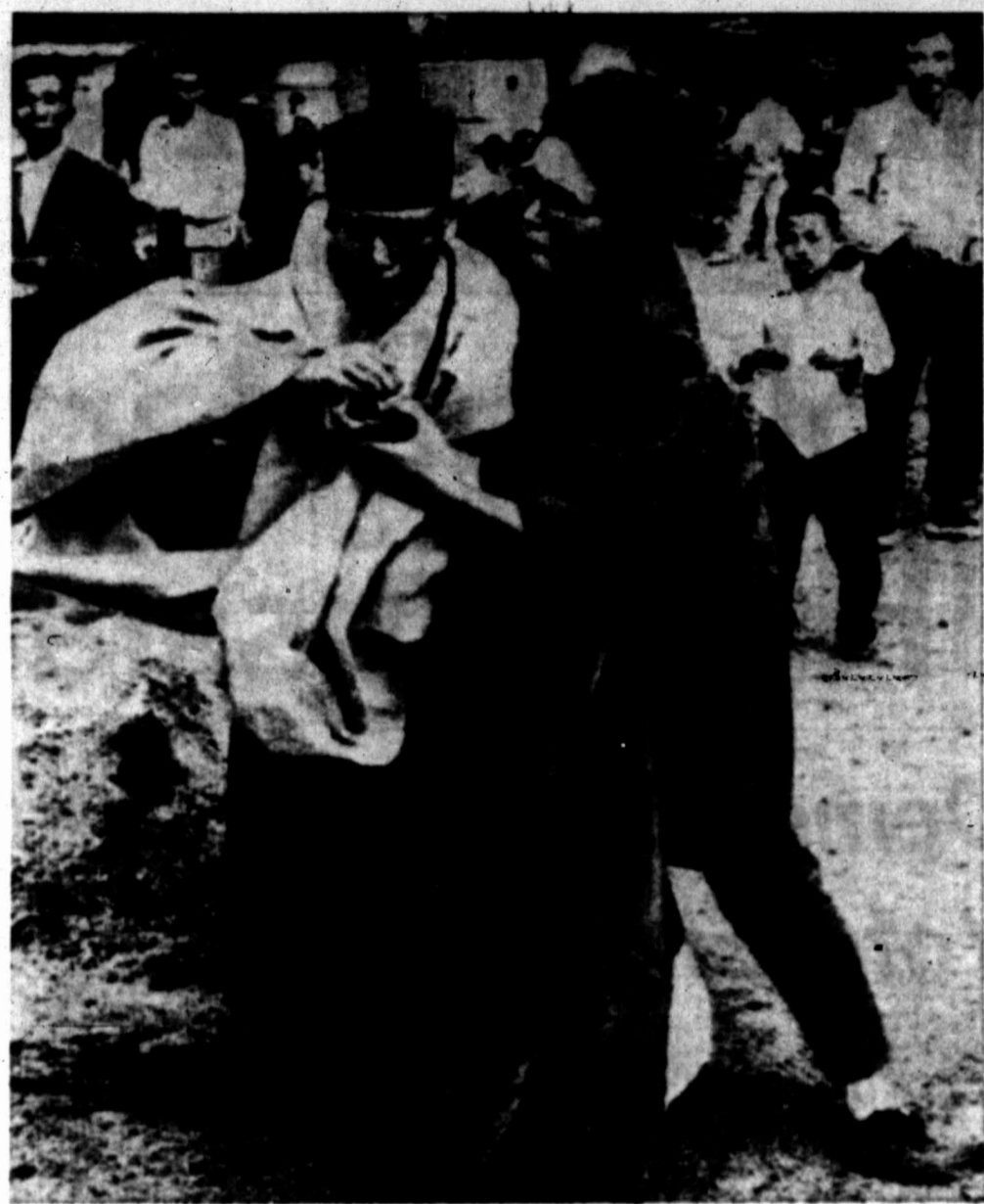
Prevents Fire Suicide

A woman snatches matches away from a Buddhist nun as the nun attempts to set herself on fire after drenching herself with gasoline in Pagoda Park, Seoul, South Korea, today. She made attempt to protest the government's alleged discrimination against married Buddhist monks.