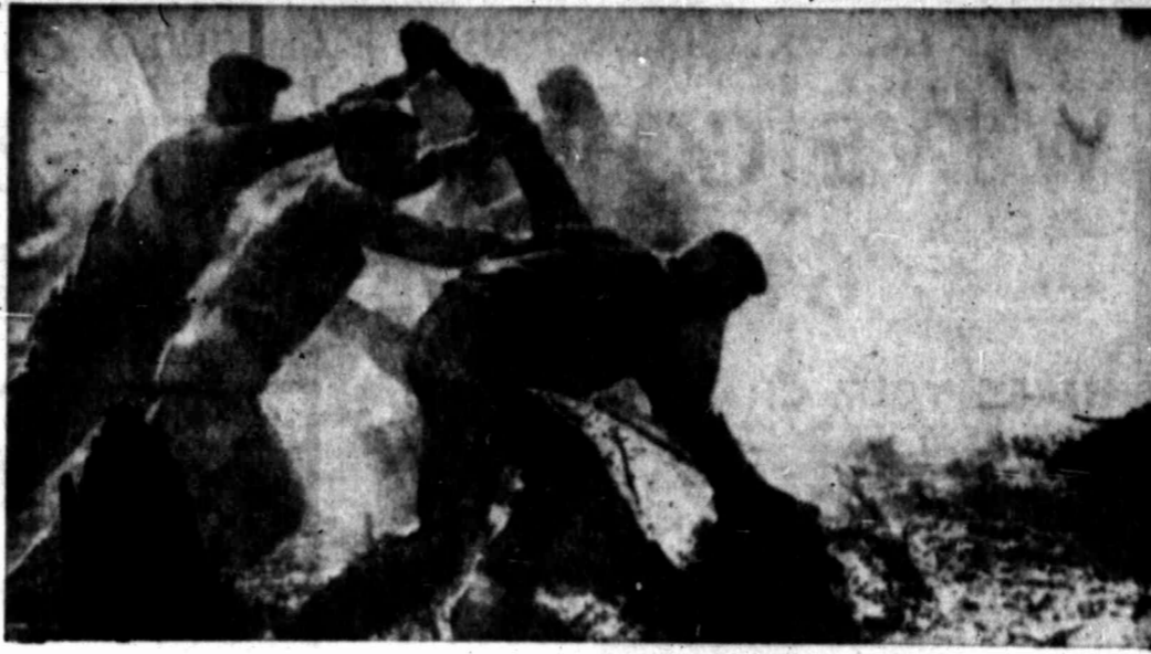
FIRE-FIGHTING VOLUNTEERS LEND A HAND Workers help clear lane through blazing New York woodland