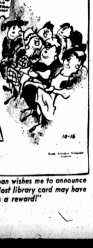
"The book review chairman wishes me to announce that anyone finding her last library card may have the job as a reward!"

GRIN AND BEAR IT NOW IS THE TIME To look for the Best Opportunity Write today for interview-Box 411, Midway, Texas.