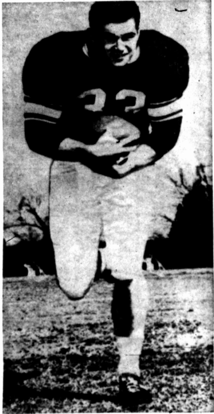
OU's Dismissed Halfback