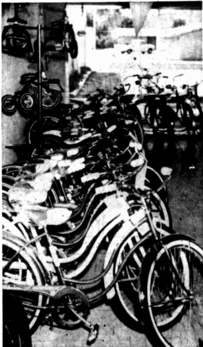
Thixton Has Your Size

creases riding comfort in the car. It has the greatest stopping power on the road, and furnishes the greatest blowout protection at all speeds. Ted Phillips, at Phillips Tire Co., invites car owners interested in extra safety to come by the store and "talk tires." Truck and tractor owners may also get guaranteed tires, for all sizes of vehicles, at the store. For all types of service, pertaining to tires, the Phillips Tire Co. can satisfy the most exacting owner of any kind of vehicle. The better the service rendered the less expensive it becomes for all vehicle owners. It adds to the feeling of safety. Phillips Tire Co. also furnishes all services where tires are concerned. Your old tires may be recapped if the carcass is good and will give you many more miles of excellent service. If the wheels on your car are out of balance, causing tires to wear, Phillips can remedy that. If you have an old jalopy, on which you do not want to put new tires, the company has a good line of used tires. U.S. Royal manufacturers adopted a bonding agent which keeps treads from turning loose from the fabric on tires. The famous four-inch bonded strip-tread, in which a standard automobile was lifted 15 feet off the ground, and held while a helicopter flew in a circle, resulted in U.S. Royal's adoption of the method.