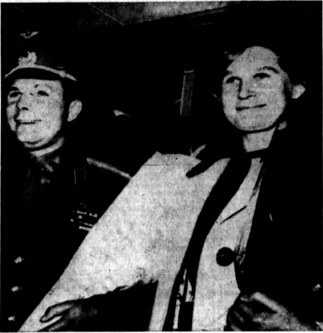
Soviet Cosmonauts In New York

Soviet cosmonauts Maj. Yuri Gagarin and Valentina Tereshkova, first man and only woman to orbit the earth, posed last night at New York's International Airport following flight from Mexico City. They plan a one-day visit in New York.