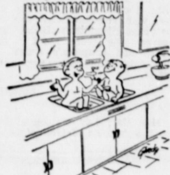
"You wash—and I'll wipe."