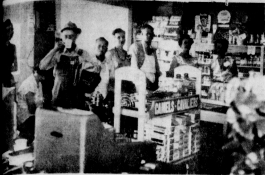
A group of folks who attended the Market Basket official opening Saturday.