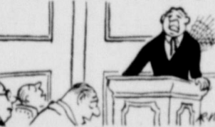
"A filibuster is a speech timed with a calendar watch."