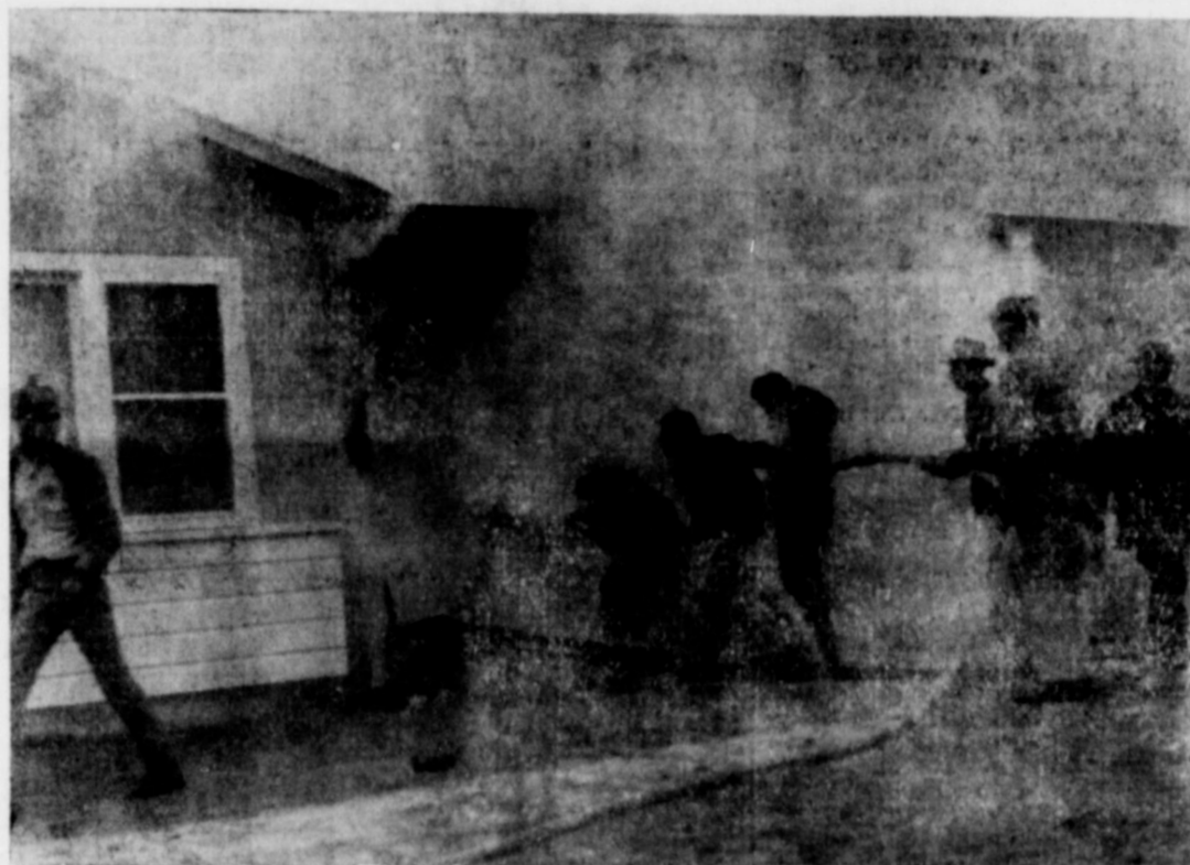
FIREMEN WORK FRANTICALLY -- To extinguish the fire at the Wendell Clayton home Wednesday. When they discovered all the hydrants in town frozen and the pump in the new fire truck frozen up tight, they lost no time in using the old fire truck and succeeded in saving the house. The attached garage and car was termed a total loss.

Lamb County Judge, Pat Boone and Bailey County Judge Glen Williams will be the principal speakers for the program. Films will be shown on Civil