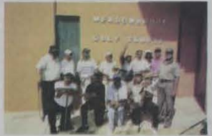
Kango Golf Association Members