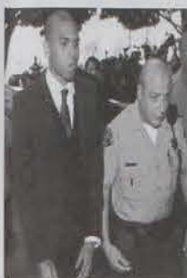
Chris Brown arrives for his sentencing hearing at Los Angeles County Superior Court Tuesday.

LOS ANGELES (AP) — A judge on Tuesday sentenced Chris Brown to five years' probation and six months' community labor for the beating of Rihanna and issued a stern admonition to the R&B singer.