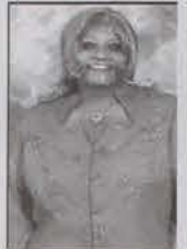
Fashion tip.... always a wear smile.... Fashion .... just for the Fun of it!!

and the world of everyone that's in your presence. Update your wardrobe instantly by simply adding a colorful hand bag. Outfitted with a zippered main compartment with full lining, two open pockets, one zip pocket.