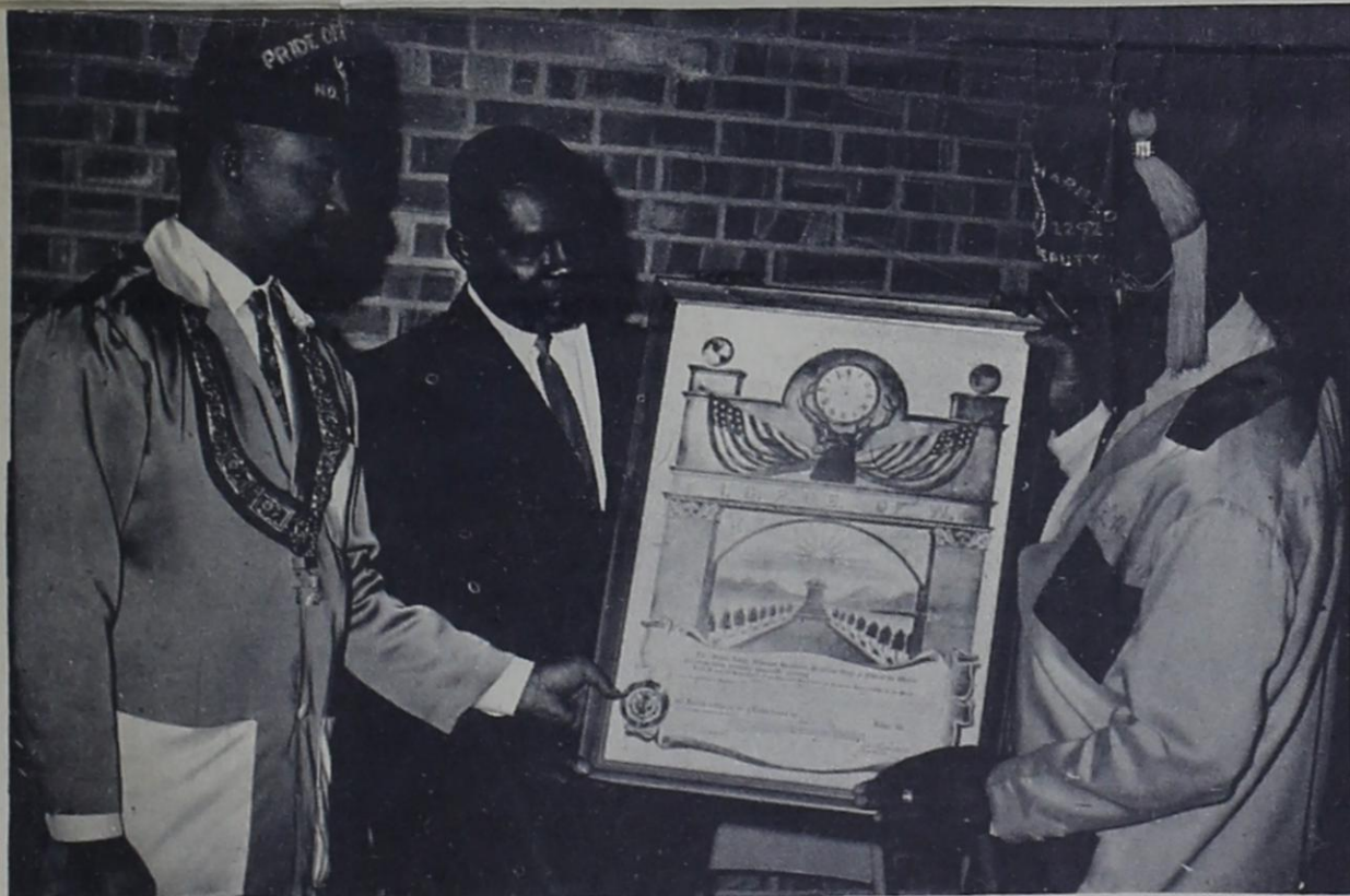
Pictured above are the District and State Officials who are responsible for the organization of