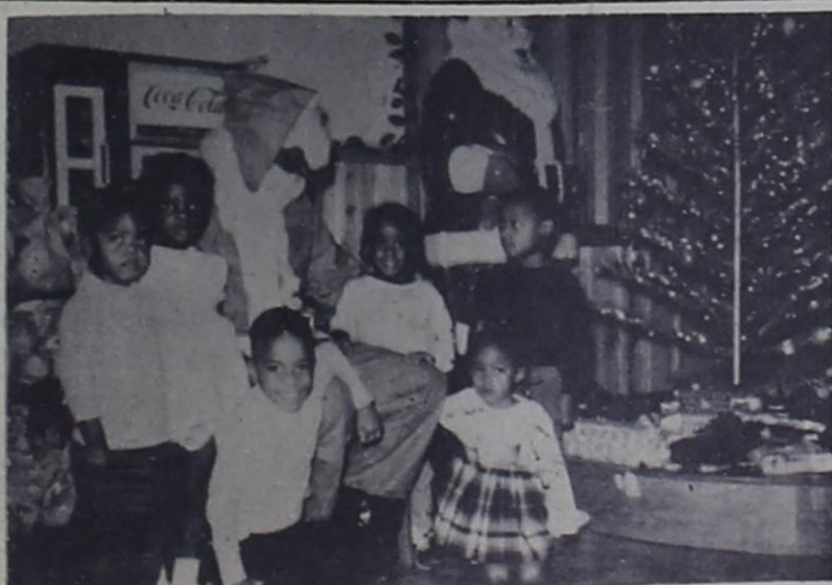
These six little tots were really surprised when Santa walked into the cafeteria of Mary & Mac