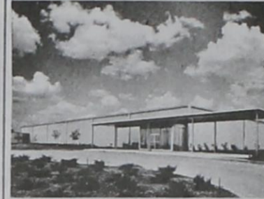
Litton's New Home

He added, "It is the result of many favorable attractions in Texas for industrial and business development and tireless work on part of ma-