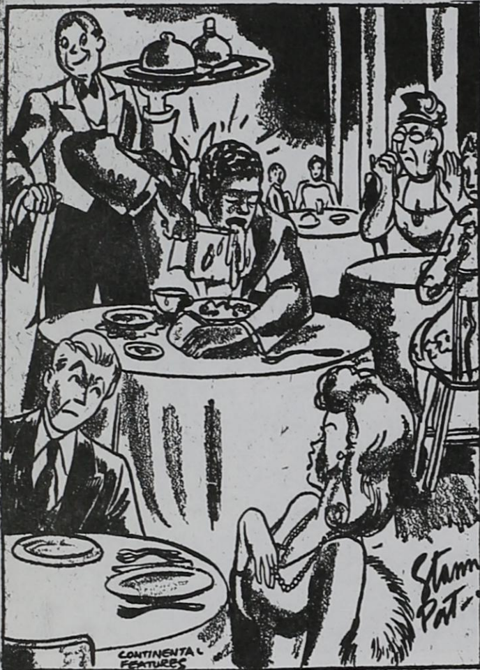
Don't Be the Center of Attention.