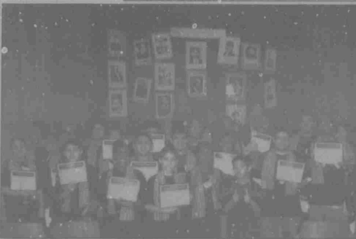
Young People Who Participated 15th Annual African American History Bowl

Thank you to the St. John Baptist Church members for their continued prayers and support of our students who attend Alderson Middle School. Please continue