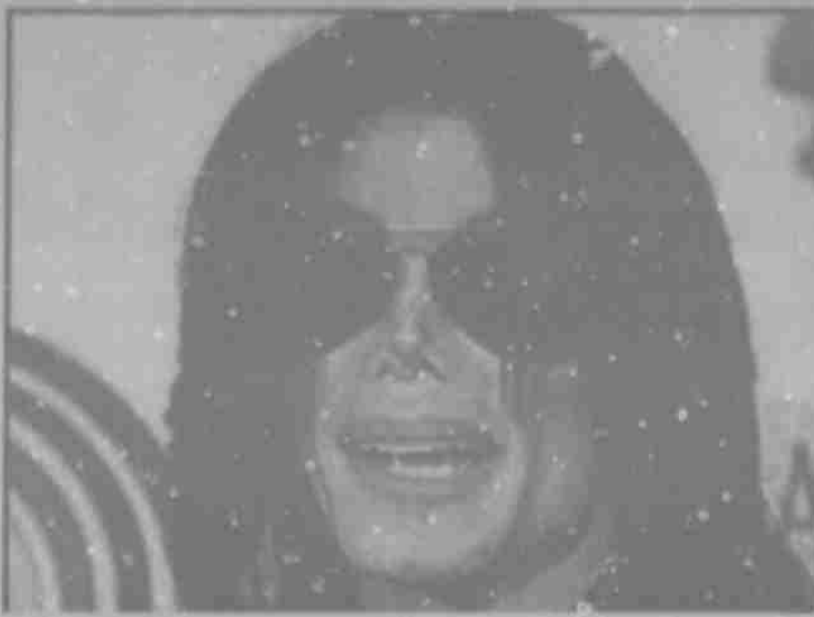
As of January 17, 2008 Michael Jackson had $153,910 missed payments on a home used by his family.

did not immediately return a call for comment.