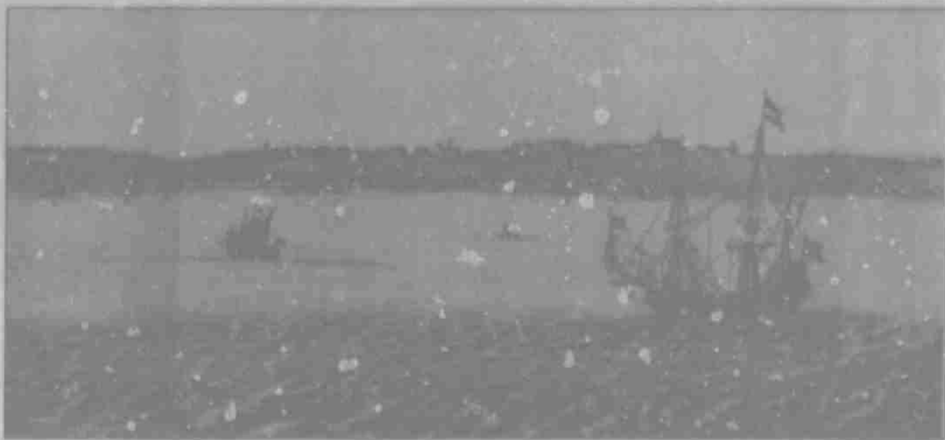
WILLIAMSBURG, Va. -- "The Angola to Virginia Connection: 1619-1999," August 21 at Jamestown Settlement, will commemorate 380 years of African American heritage and recognize the newly discovered Angolan origins of the first Africans in Virginia. Above: The port of Luanda, Angola, from the 1686 French language edition of "Description of Africa" by Olfert Dapper, 1668.) Below: Legacy of Weyanoke will perform songs and stories from the African heritage.