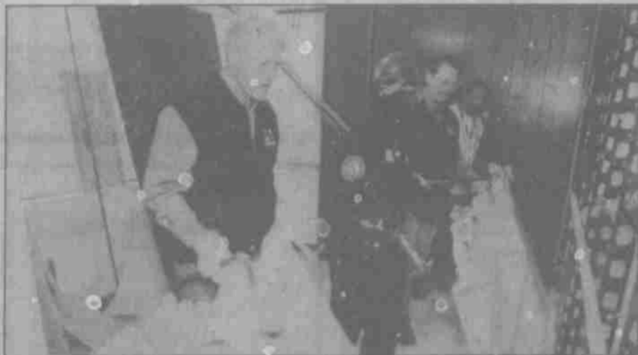
Standing from left to right: President Bill Clinton and Vice President Al Gore joined by two AmeriCorps volunteers.

The settlement closes HUD's investigation of the lending