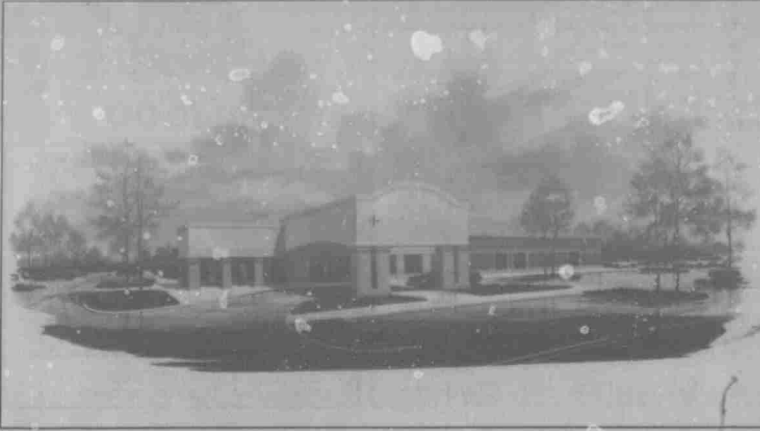
Pictured above is an architect's rendering of the St. Mary Family Healthcare Center—Snyder, located at 5001 College Avenue.

LUBBOCK, TEXAS—The public is invited to attend groundbreaking ceremonies for St. Mary Family Healthcare Center—Snyder, at 1 p.m., Thursday, March 21, 1996, at 5001 College Avenue.