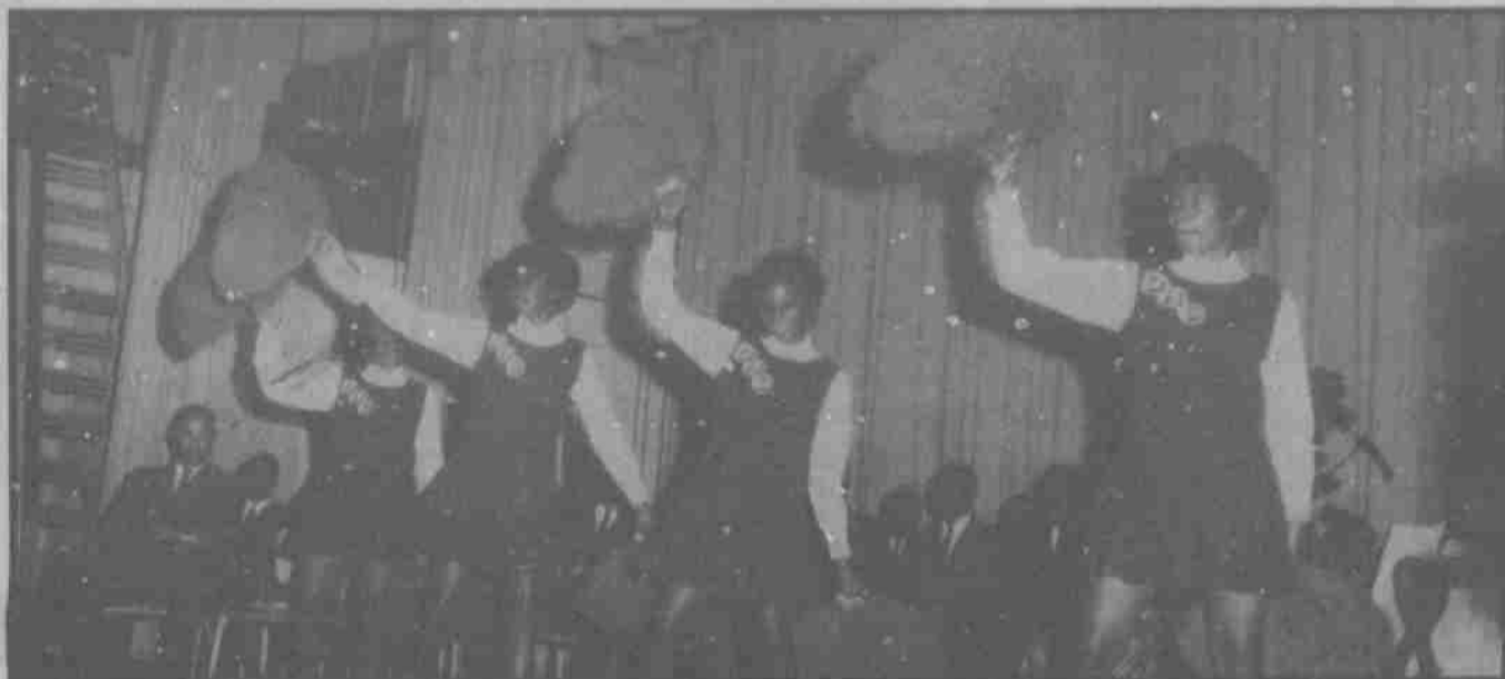
CAN YOU NAME THESE FORMER DUNBAR CHEERLEADERS?