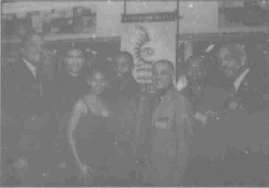
CELEBRITIES GATHER FOR BLACK FILM AWARDS NOMINATIONS