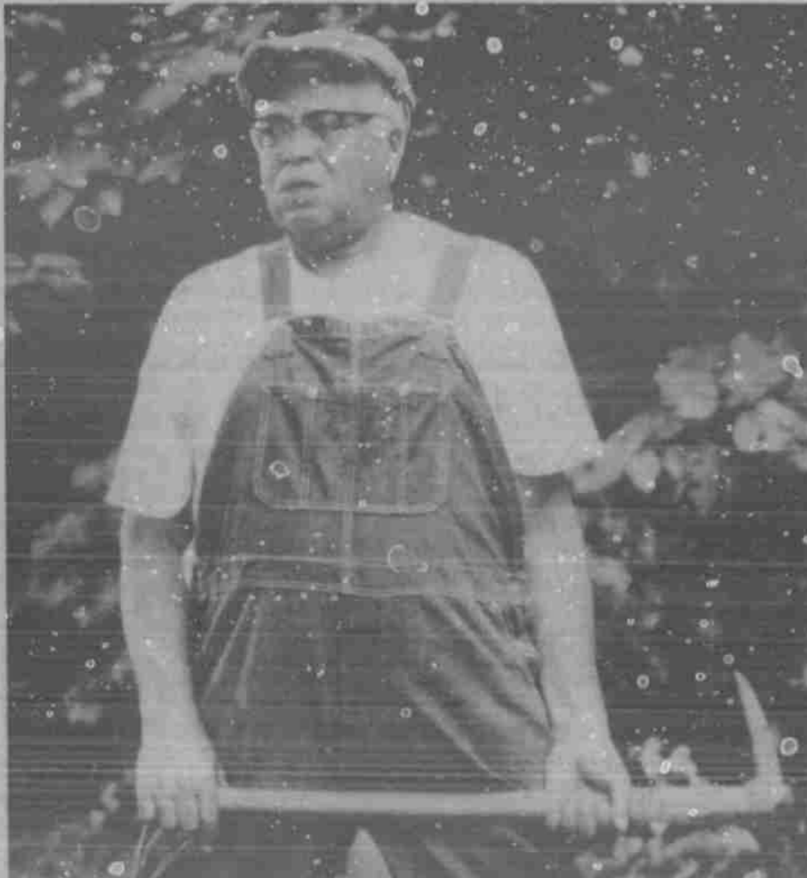
Johns starts a garden in his back yard and later sells fruits and vegetables off the back of a truck in the church yard. Johns is eventually relieved of his pastorate because of his unpopular notions about social change and economic independence for Blacks. The Vernon Johns Story is a two-hour television movie airing January, 1994. Check local listings for date and time.