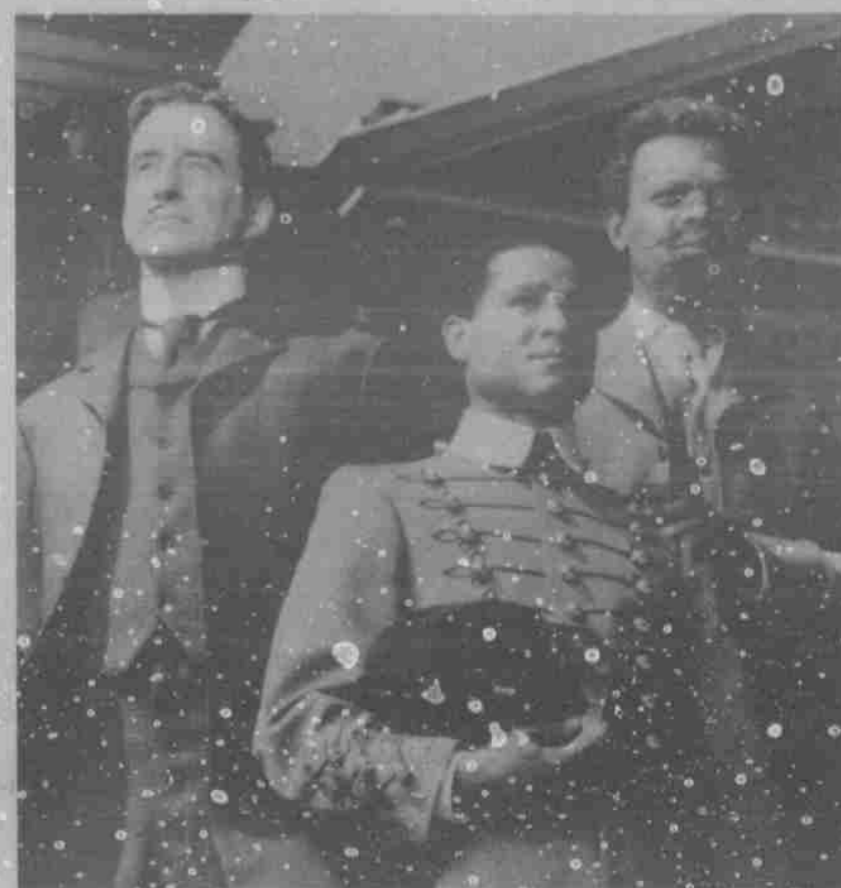
SHOWTIME celebrates Black History Month in February of 1994 with the premiere of the original film Assault at West Point . (Above, l to r) Sam Waterston, Seth Gilliam and Samuel L. Jackson star in this powerful drama about one of the first African-Americans admitted to West Point.

Over a hundred years later, the film has startling relevance to present-day controversies. A testament against racism and intolerance, Assault at West Point is an important reminder of the issues our society continues to struggle with.