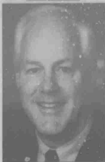
Obtaining Past-Due Child Support

Q: My child's other parent has considerable financial assets but doesn't pay child support. Can the AG's Office get me the money that is owed?