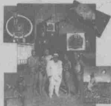
Flying Fools High Dive Show