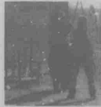
Steeples Wild West