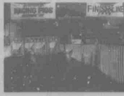
Hedrick's Racing Pigs