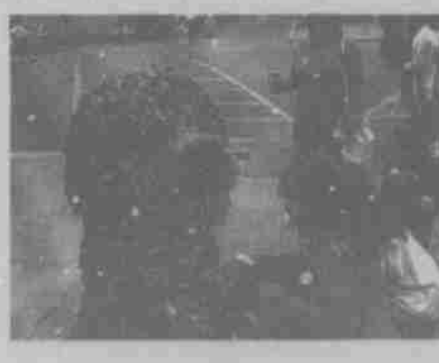
Bruiser the World's Largest Dog