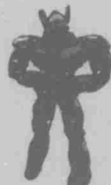
Rock-it the Robot