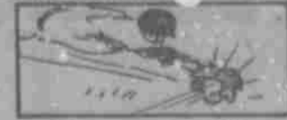
Sandy Amoros, the Dodger's left fielder, made history in the seventh game of the World Series with a lunging catch of Yogi Berra's line drive, giving the Brooklyn Dodgers a victory over the N.Y. Yankees in 1956.