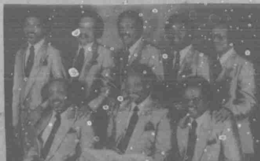
Zion Jubilee Singers

The Zion Jubilee Singers of Bryant, Texas will be appearing at the St. John Baptist Church, 1712 East 29th Street, Saturday, September 5, 1992 at 8:00 p. m., and Sunday afternoon, September 6, 1992, at 3:00 p. m.