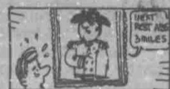
The Louvre Museum in Paris has about eight miles of galleries.