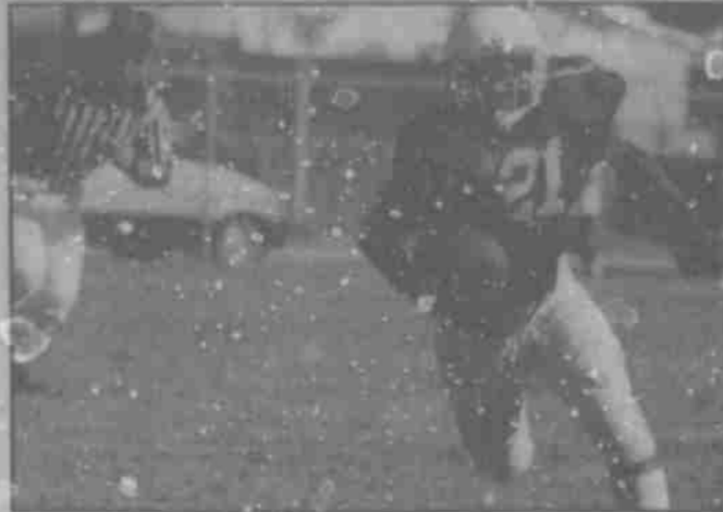
No way can you stop "Puppy"!