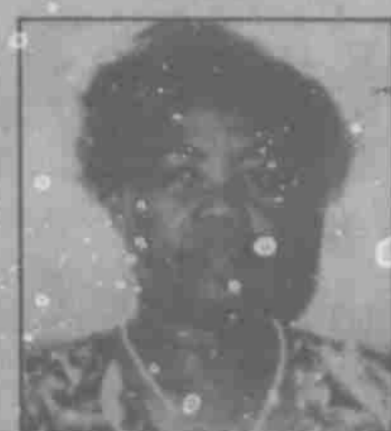
Mrs. Phoenix First C.O.G.I.C., Slaton