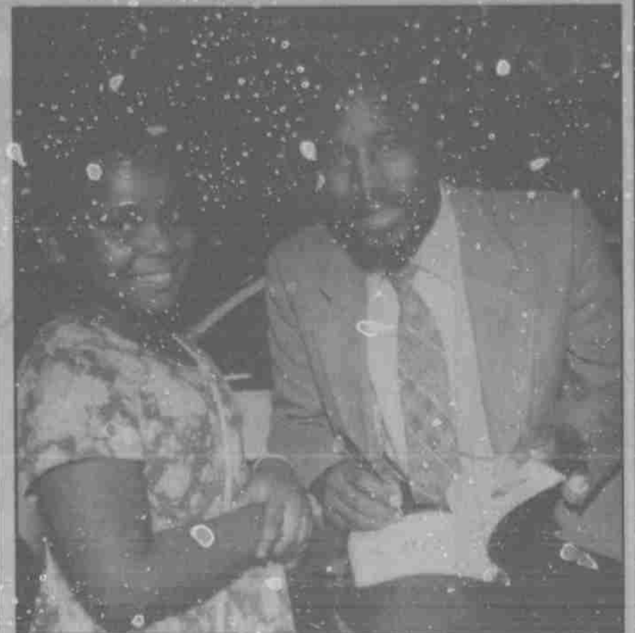
Renowned neurosurgeon, Dr. Ben Carson autographs a copy of his book, "Gifted Hands, The Ben Carson Story" for a young admirer. More than 200 lucky conventioners received a copy of Dr. Carson's Book courtesy of Toyota at the 24th Annual Congressional Black Caucus Legislative Weekend in Washington, D.C.