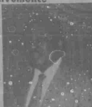
Ossie B. Curry