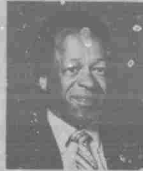
BY HON. GUS SAVAGE First Black Journalist ever elected to Congress