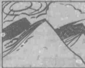
Jim Backwourth, a Black man, discovered a pass through the Sierra Nevada mountains to California and the Pacific Ocean in 1844.