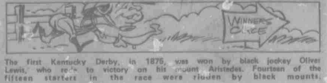
The first Kentucky Derby, in 1875, was won by black jockey Oliver Lewis, who rode to victory on his mount Aristides. Fourteen of the fifteen starters in the race were ridden by black mounts.