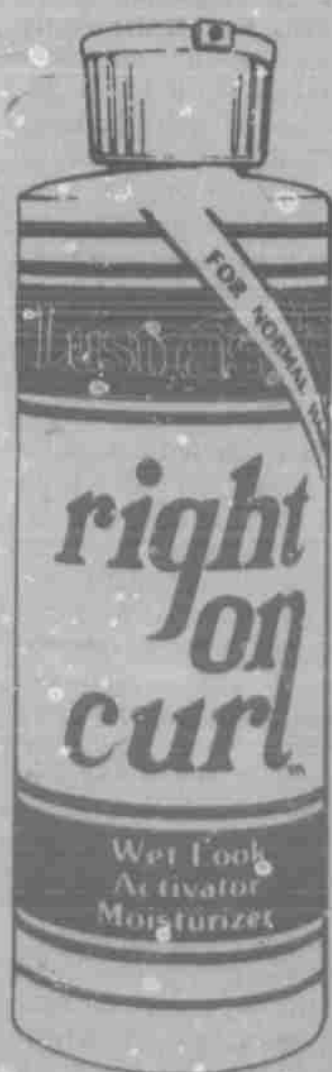
Right On Curl For Normal Hair