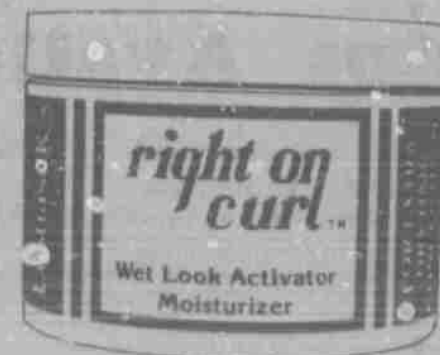
Right On Curl FOR EXTRA-DRY HAIR 2 OZ. - GEL 8 OZ. - GEL