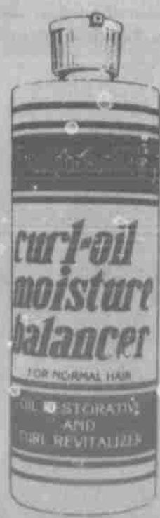
Curl-Oil Moisture Balance FOR NORMAL HAIR 3 OZ. - LIQUID