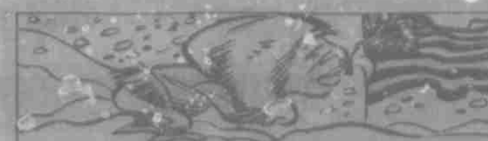
In 1908, Black explorer Matthew Henson placed the U.S. flag at the North Pole.

The present and future earning power of a business or pleasure from a product are of prime importance. If a business is not at least equal in earning power to an outside investment in securities, like stock and bonds, or a product is inferior to other products but cheaper, do not buy. Eventually, with the damage to the economy being done now by the administration an one with a buck will easily with a little entrepreneurialship earn several bucks for each one spent.