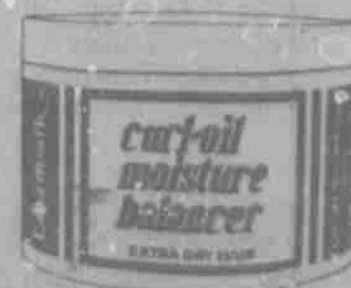
Curl-Oil Moisture Balancer FOR EXTRA-DRY HAIR 2 OZ. - GEL 8 OZ. - GEL