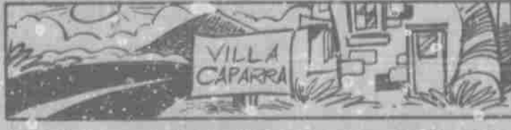
Villa Caparra, on the road from San Juan to Bayamon, was the first Spanish settlement in Puerto Rico. It was founded by Juan Ponce de Leon in 1508.

Black poets, who may wish exposure to our reading public, may send copies of their poetry—for editing and with permission to use—in groups of 12 poems or more to Black Resources, Inc. PHC, 410 Central Park West, New York, NY 10025. Poetry selected should normally appear within 12 to 22 weeks. Because of staff limitations, no copies are returned.