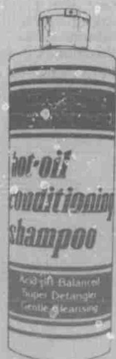
Hot-Oil Conditioning Shampoo 6 OZ. - LIQUID