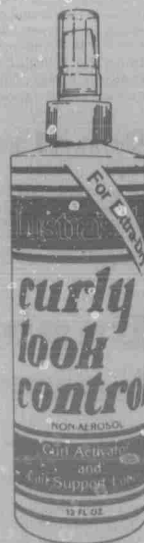
Curly Look Control CURL ACTIVATOR 12 OZ. - LIQUID