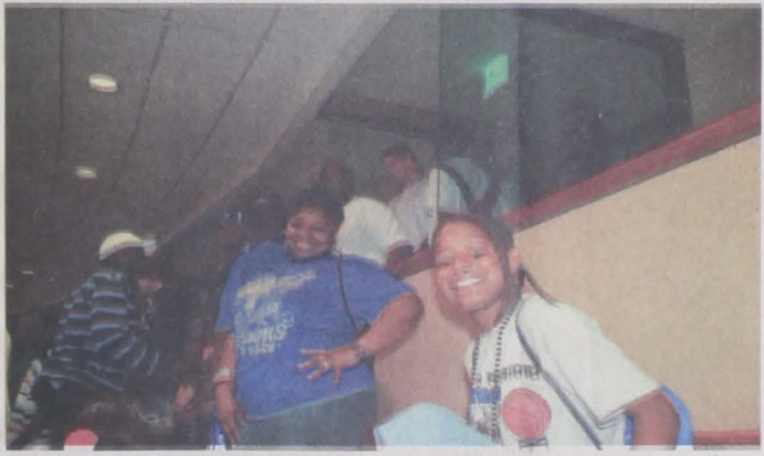
A YOUNG MATADOR FAN -- This young Matador fan is all smiles after the Matadors defeated Dallas Madison Trojans 69-63 for State 3A Championship last Saturday in Austin.