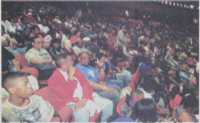
EXCITED MATADOR FANS -- Matador fans are shown during the game against Dallas madison Trojans in the Frank Ervin Center in Austin last Saturday, March 13, 2010.