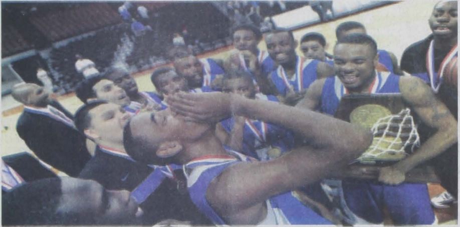
WINNERS' EXPRESSION -- Shortly after defeating the Dallas Madison Trojans, Estacado High School Matadors are showing how excited they were! All are winners of a game well played!