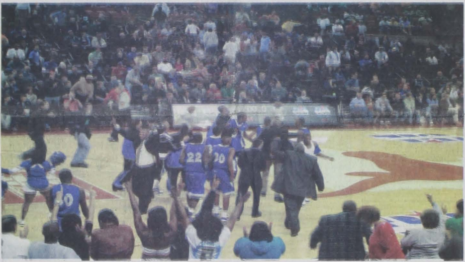
MATADORS & FANS EXCITED -- It was a very exciting moment after winning 3A State Championship by the Matadors last Saturday, March 13, 2010 in Austin.