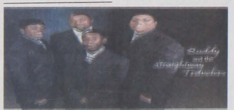
Buddy & Straightway Travelers