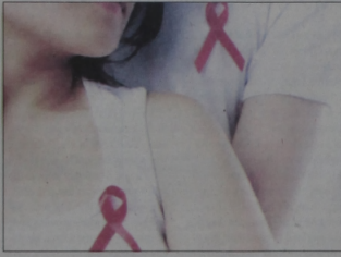
La Comisión Latina sobre el Sida y la farmacéutica