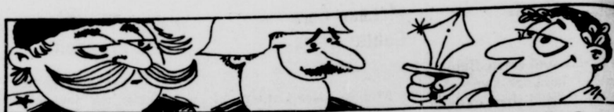
The Russian Tsar and the German Kaiser their titles took from the Roman Julius Caesar.

Oil and gas reserves were the only type of property where the quality of appraisals deteriorated. The SPTB study indicates that these properties were typically appraised at 109 percent of their market value for 1986 taxes, compared to 104 percent the previous year. "The uncertainty in the oil market at the end of 1985 probably made appraising these properties more difficult," said Patterson.