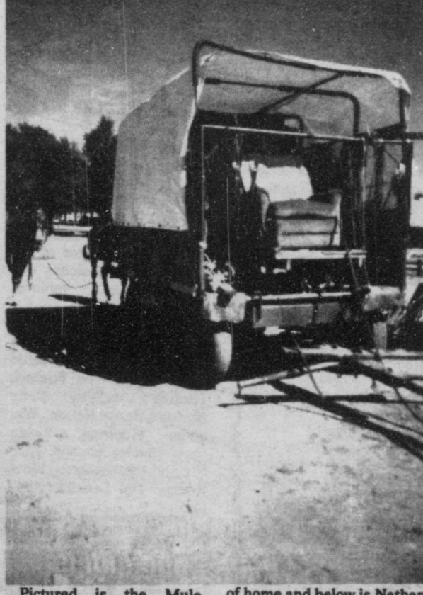
Pictured is the Mule Wagon above with comforts

Attendance incentives are iven by the school. Each student that has not been absent during the accounting period will receive a Blizzard from the local Dairy Queen and all eligible names will be put in a box and a drawing will be held for a "Jam Box".