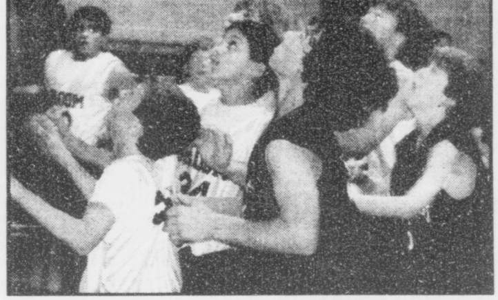
Groom teams play a couple of very physical games against McLean.