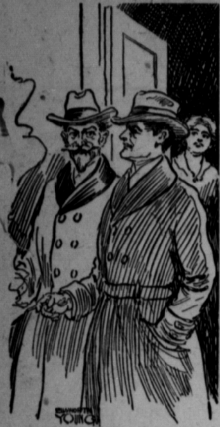
They Left Together.