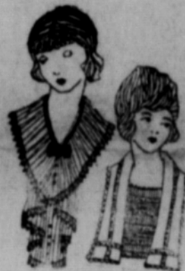
Neckwear Accessories In Great Variety.

THERE'S SATISFACTION IN EVERY ONE OF THE SMART SPRING STYLES WE ARE SHOWING—A FIT AND FINISH THAT WILL MAKE YOU FEEL HAPPY, PROSPEROUS AND ALTOGETHER "JUST RIGHT." IF YOU COME IN NOW YOU'LL "STEAL A MARCH" ON THE LATE SHOPPER BY GETTING FIRST CHOICE. MANY THINGS, TOO, IN BRIGHT NEW SPRING HABERDASHERY—SOMETHING IN SHIRTS, TIES, HOSIERY, ETC., THAT YOU WILL BE PROUD TO POSSESS.