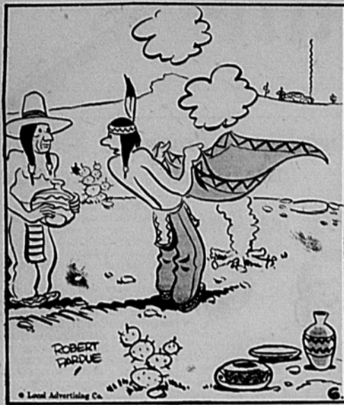
"Me tellum paleface, next time takeum car to CROW-HARRAL CHEVROLET CO. and gettum fix right."