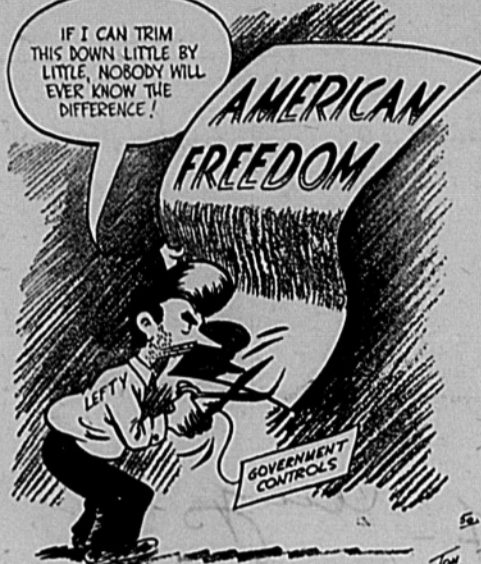
No Use, Lefty