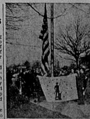
Battle Flags of the Schools