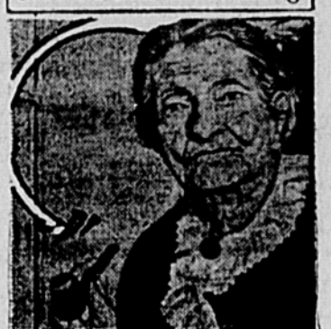
salls her pipe her best friend. She is 91 years of age and believes smoling and drinking strong coffee in moderation prolong her hise.