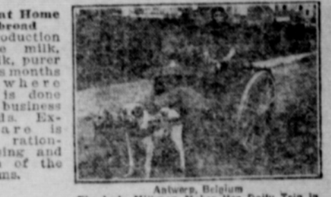
Antwerp, Belgium The Lady Milkman Makes Her Daily Trip in Her Dog Chaise In Belgium, you know, as well as in Holland, it is a very common thing to see a team of dogs hitched to a milk wagon, but usually the owner of the team gives them a helping push. This lady must have been tired or she would surely have helped out her little team.