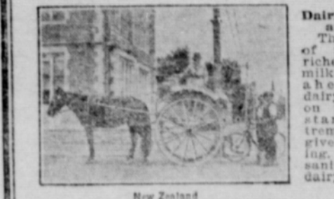
New Zealand Early in the Morning the Milkman Arrives Wellington, N. Z. Milk supply is all under the control of the City which permits the milk to be sold except that which has been inspected and certified by the Health officials. The City buys the milk from the farmers and allows peddlers to sell it at a fixed price--No peddling here.