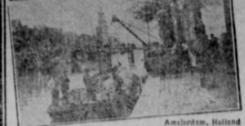
Amsterdam, Holland Unloading Cheese Along the Canal at Amsterdam Thousands of tons of Dutch cheese like those in the picture are consumed annually. A big percentage is exported. Holland is one of the most productive dairy countries, also considered in the world. The most intensive and scientific methods are practiced. Cow tending regulations are numerous.