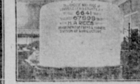
Lowville, N. Y., U. S. A. This Cheese Bell Grows at Great Lake. It took 67 lbs. of milk to make it. They do things on a big scale in the U. S. A. You may be sure that it is good to eat too, because scientific methods, up-to-date housing facilities and complete sanitary measures all enter into the production of milk in America's greatest dairy state.