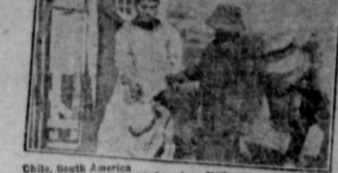
Chile, South America A South American Milkman This picture was taken in Anaco, Chile Island, Chile. A can of milk sits on either side of a male or some other native beast of burden and a quart measure are all this milkman needs to serve his train. The quart measure has two lead weights. The lady measures wear an intent look--on the lookout for short measure.