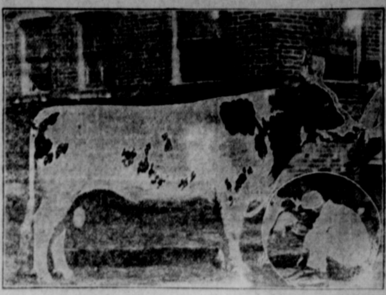
A good typical Ayrahire sire

Meny a man who is undecided as | provides desirable quarters. Continthe breed of dairy cattle that he is select has been influenced in liking his decision by the animals a particular breed that he has an particular breed that he has in public. The included the breeder secures a like year dairy animal that is to be a like year dairy animal that is to be